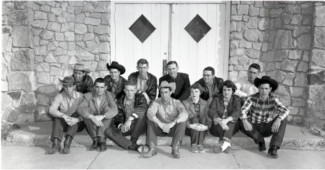
1954 WTSTC T-Anchor Rodeo Club