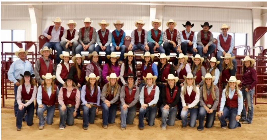
2019 WTAMU Rodeo Club